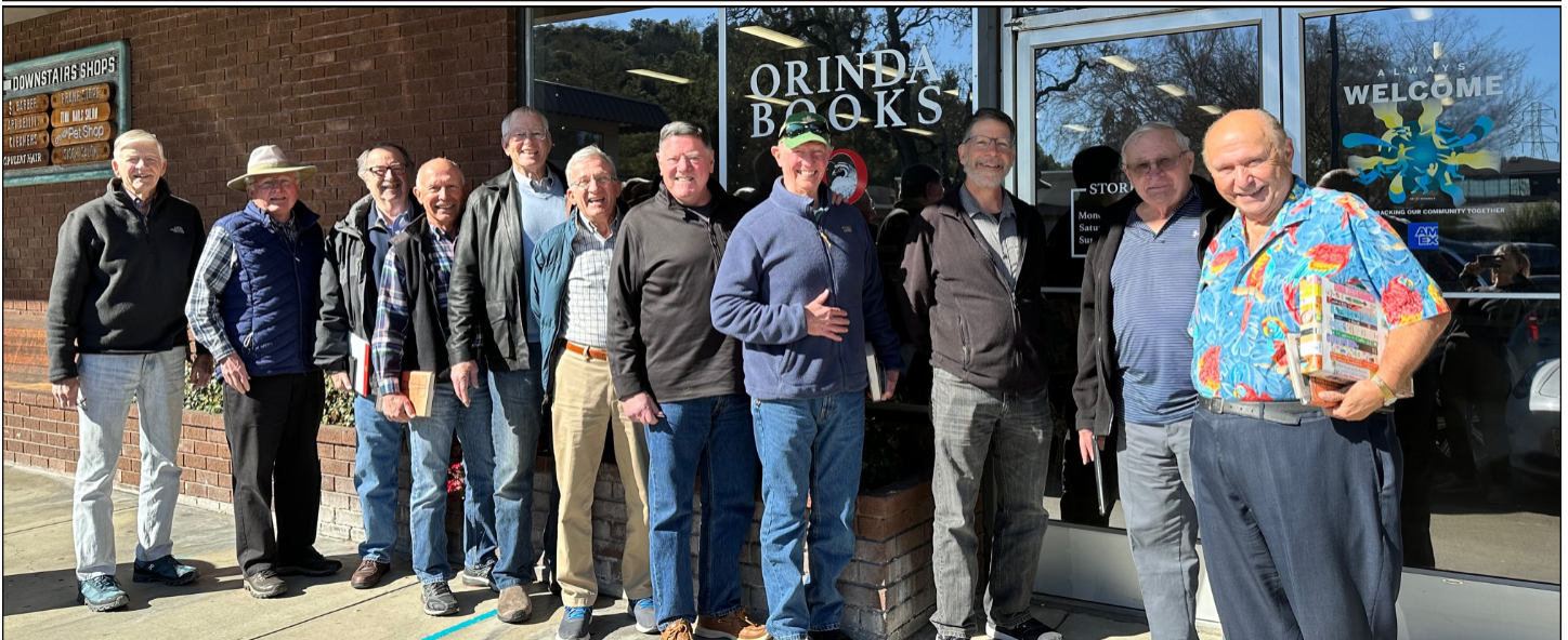
Book Group 1 gathering in front of Orinda Books on January 27th

New members are always welcome. It's a discussion, not a class. If possible, contact Rich Black at Blackrw41@comcast.net ahead of time.