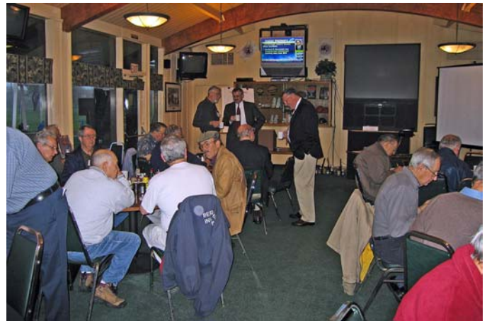
The January $ums in Retirement Meeting Had over 50 Attendees!