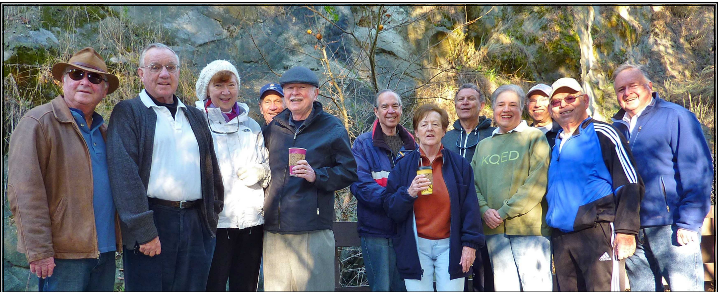
Amiable Amblers on Lafayette Moraga Trail, January 27