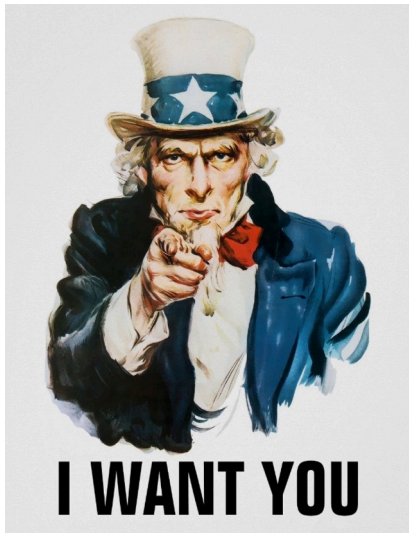
Photo is to be used for a SIR Br.116 Veterans Video celebration at our November Luncheon. If you haven't already submitted a photo, send one via email to: TrampasTopics@gmail.com . Also indicate the approximate year and location.

We want a photo of you in your military uniform