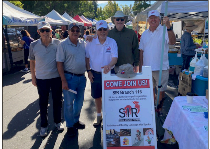
Recruitment Booth at Walnut Creek Farmers Market on October 14th