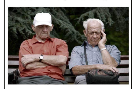
She said,"You did that yesterday" I said, "I wasn't finished".

My wife asked me what I was going to do today. I told her, "Nothing".