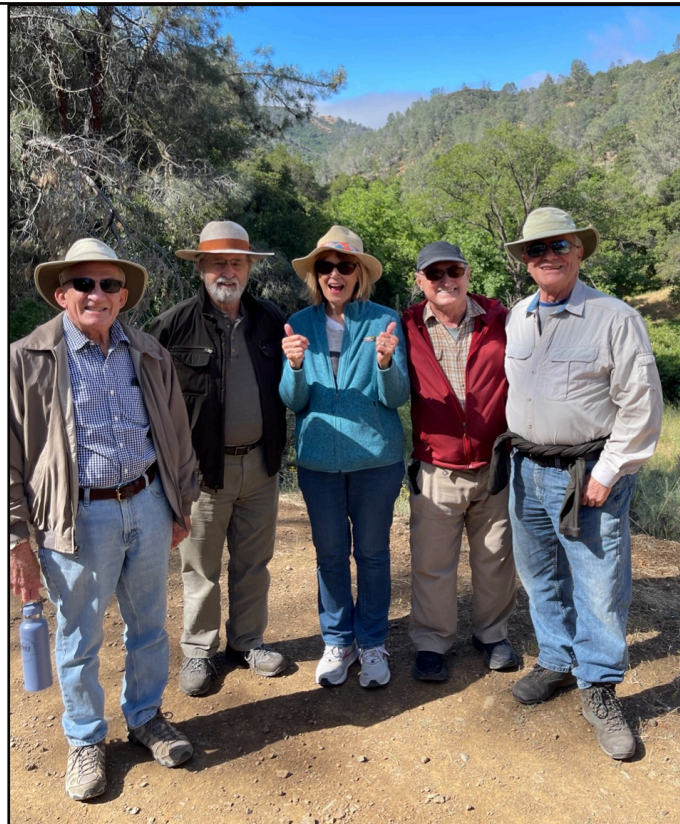
Amiable Amblers in Mitchell Canyon

These walks are for individuals or couples, as spouses and significant others are encouraged to participate. The significant other/spouse is also invited to participate even when the member is unable to. SIR members, including those from other branches, wishing to join this mellow group or to be added to the email contact list should contact me at jriordan730@gmail.com or 925-284-3394. Also contact me if you wish to be removed from the list for future emails.