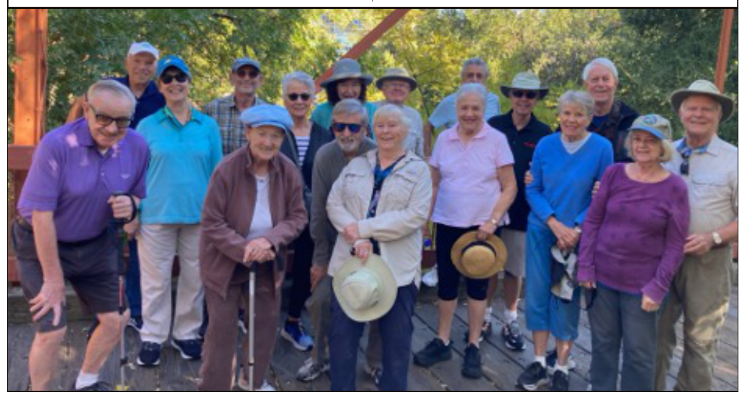
Amiable Amblers at Walnut Creek Civic Park