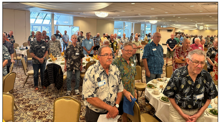
Notice all the Hawaiian Shirts at our August Luncheon