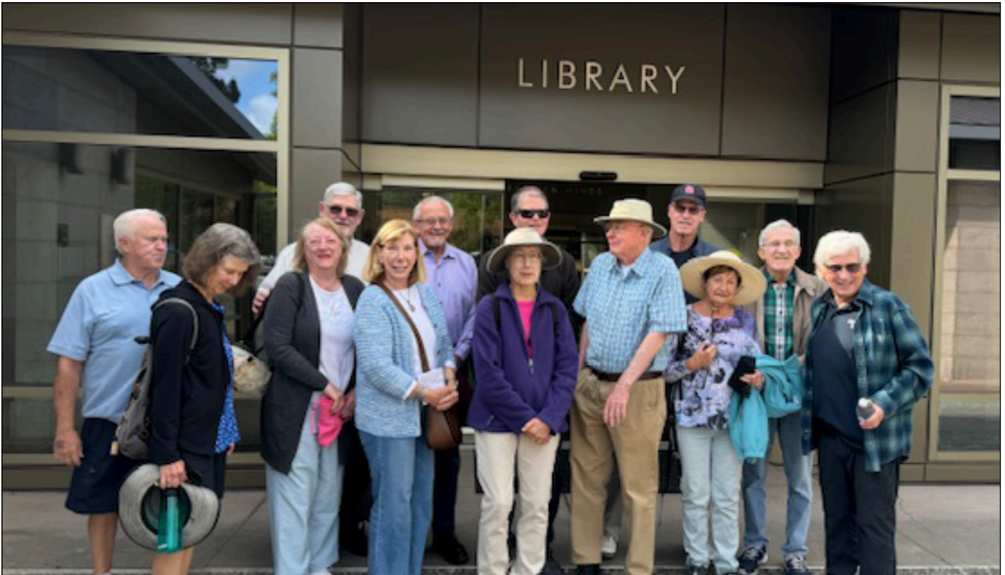
Walking Tour Group outside the Lafayette Library on August 23