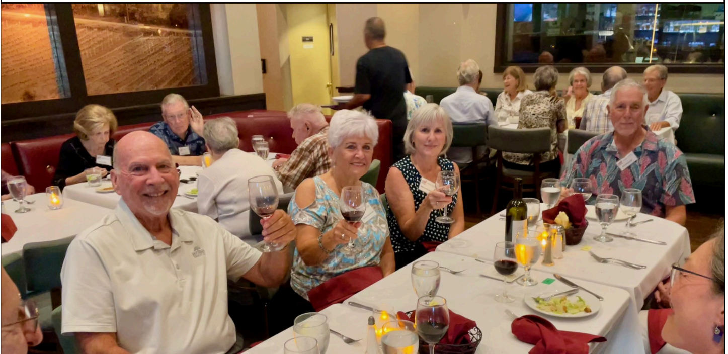
Enjoying the food (& wine) at Forli Restaurant on August 28 th